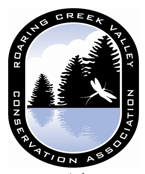
And Susquehanna Ridge Runners Club